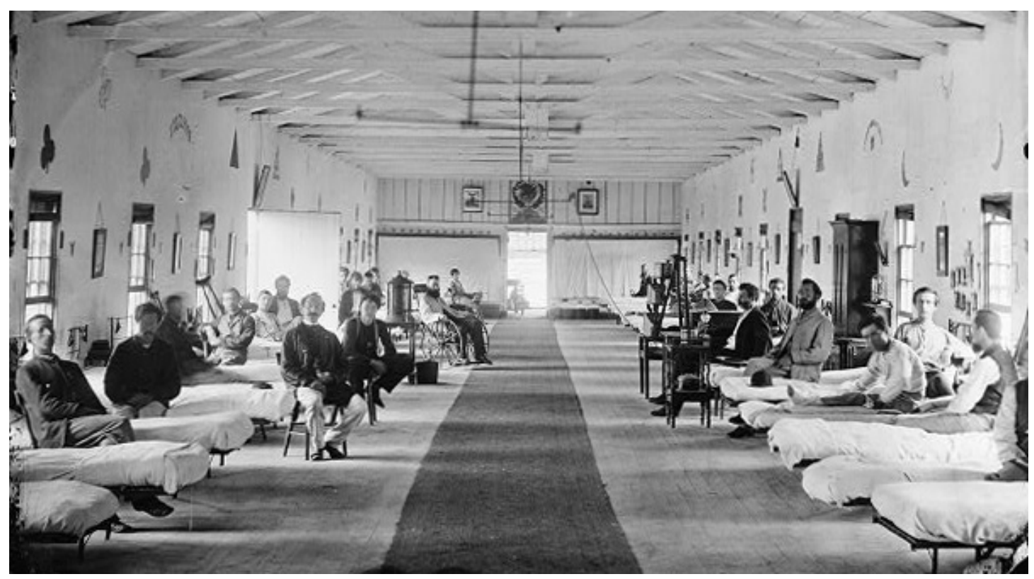
Patients in Ward K of Armory Square Hospital, Washington D.C. , August 1865.