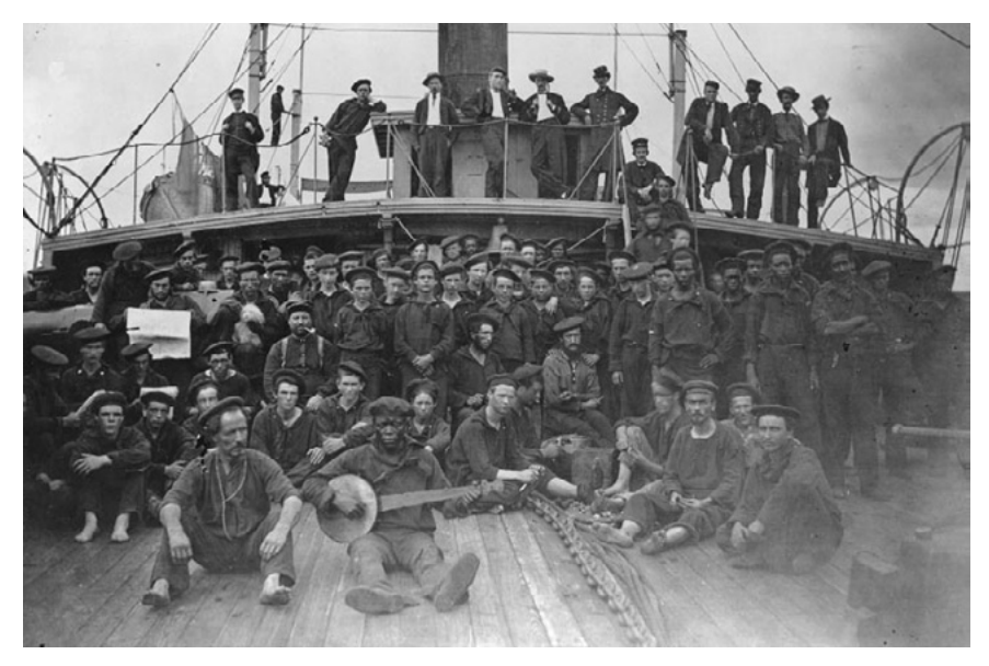
USS Hunchback Photograph of the officers and crew, of which about one fifth are African American, aboard the USS Hunchback , ca. 1864–1865.

An accomplishment of the Lincoln film is a revelation to the general public that even two years after the Emancipation Proclamation, there were significant elements in Congress who opposed the Thirteenth Amendment, who were unhappy with emancipation, and who were certainly not in favor of black citizenship. This insight into the racial attitudes of Northern congressional delegations illuminates the difficulties that Lincoln