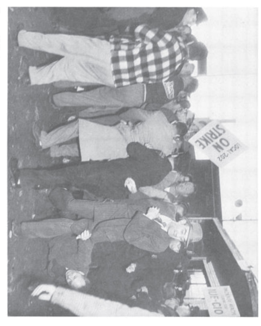
Fig. 3.1: IUE picket line scuffle in East Springfield, Massachusetts, in the 1950s. (from IUE Archives in Special Collections and University Archives)