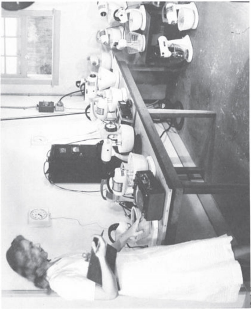
Fig. 2.2: Consumers Research produce testing of electronic mixing bowls.