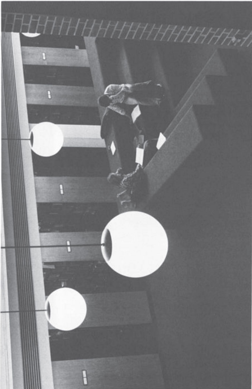
Fig. 5.5 Mabel Smith Douglass Library Phase II—Tapestry Room