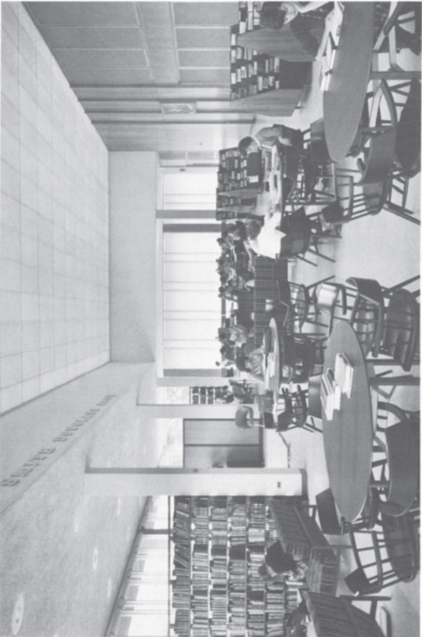
Fig. 5.4 Mabel Smith Douglass Library Phase I—Mabel Smith Douglass Room