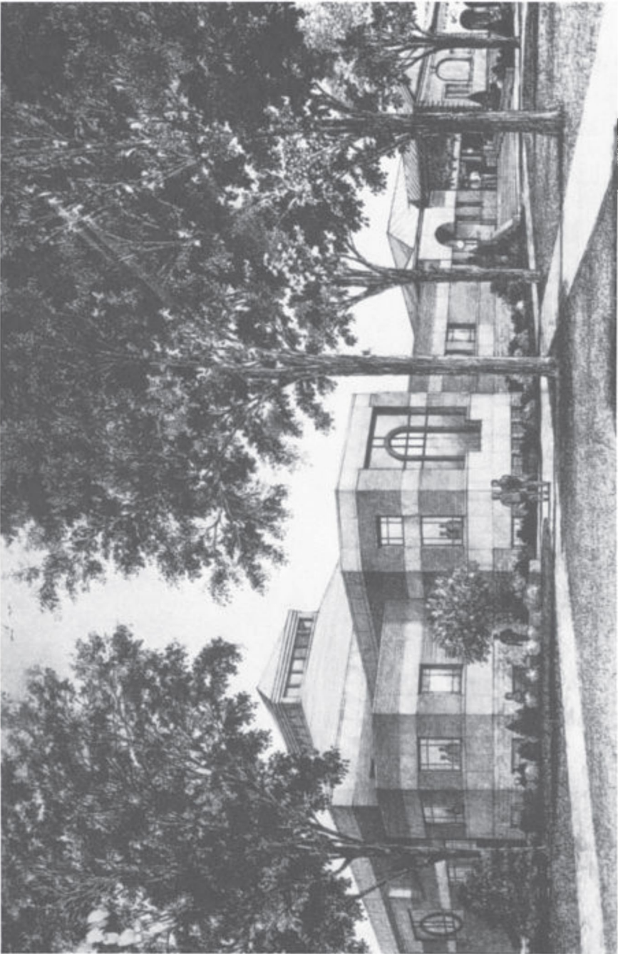
Fig. 3.1 Rutgers University Art Library (WBTL Architects)