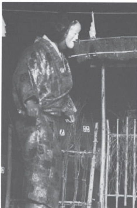
Night performance of farmer's noh drama, Matsuyama-city, near Tsuruoka.