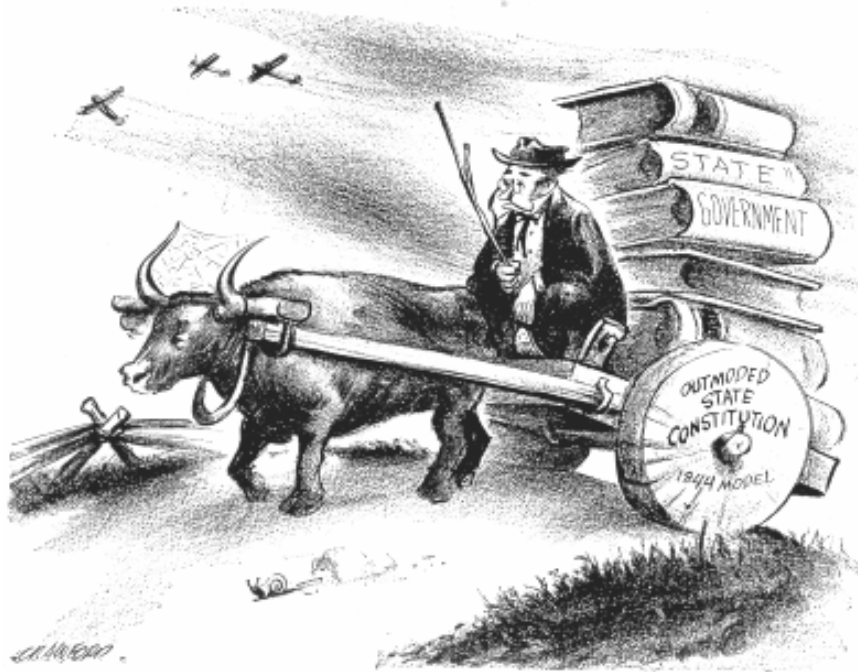
Fig. 1.1 Cartoon from Newark Evening News 12 May 1943 illustrating the out-of-date condition of the 1844 Constitution.